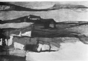
Beach Scene : oil