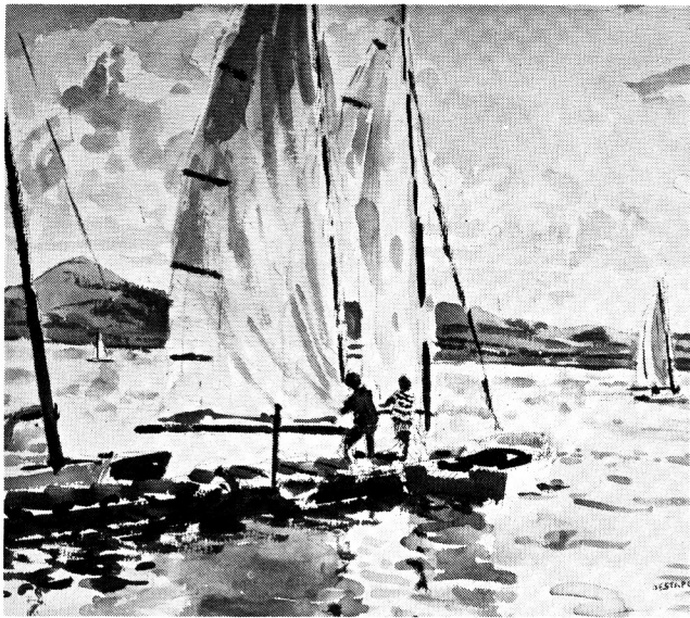
Yachts : Haartebeespoort Dam.